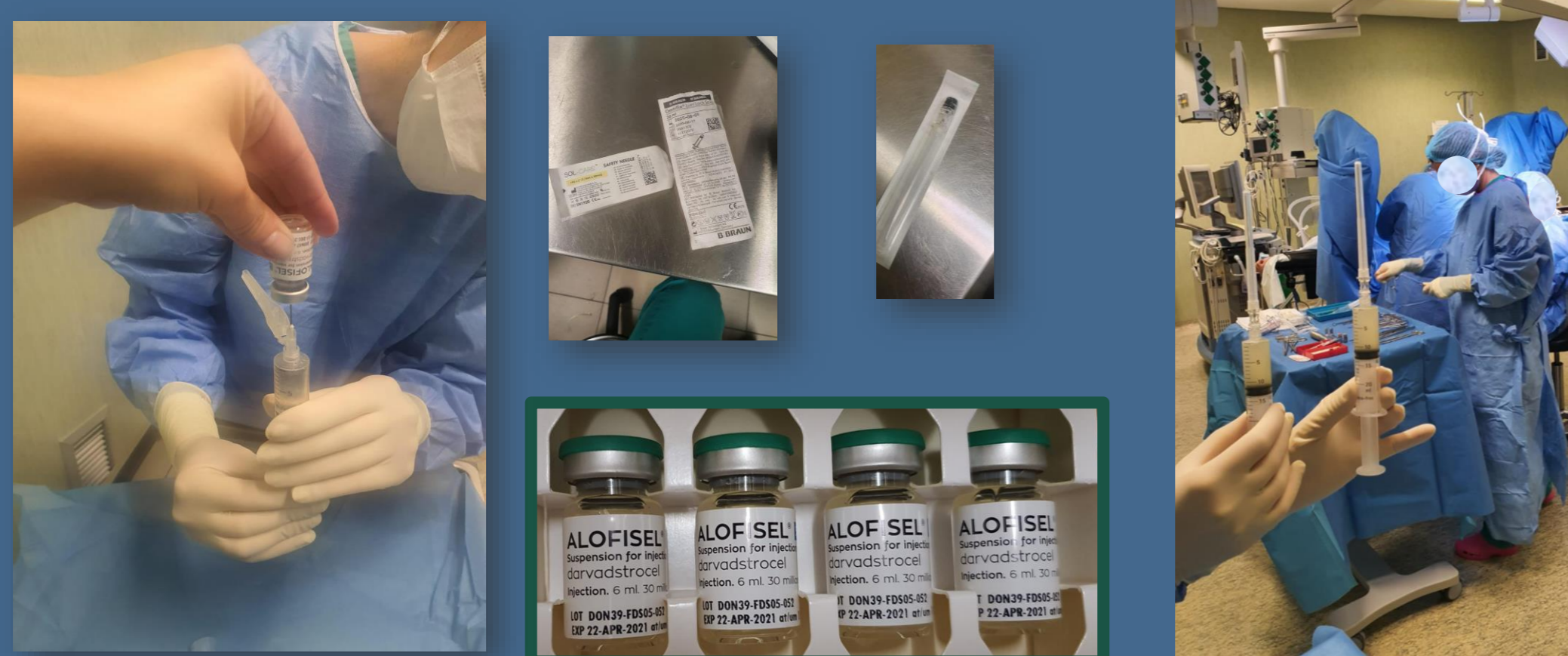
Figure 1. The pharmacists handled darvadstrocel in the operating room.